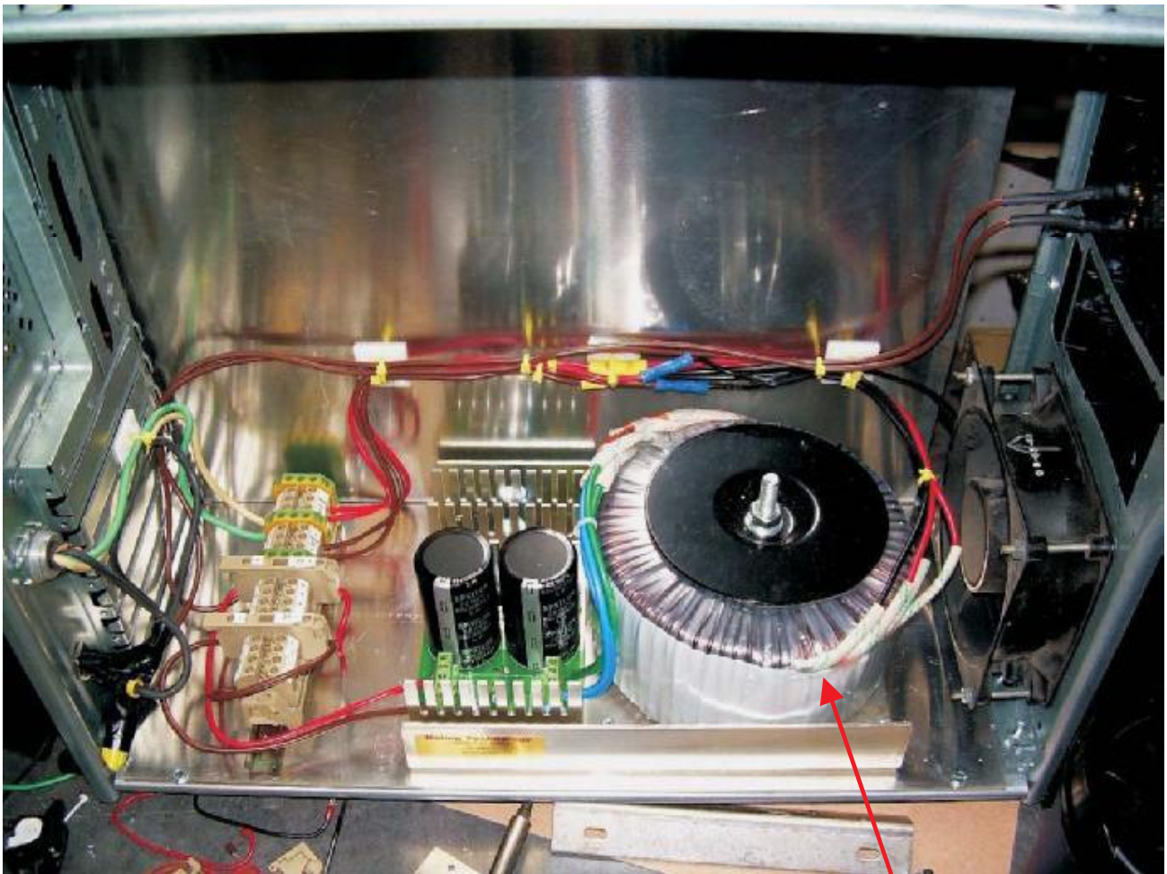
Keling Technology, Inc KL-6515 power supply

Purchased the computer case from Frye Electronic store and removed the motherboard sheet metal and replace it with .100 aluminum sheet metal. Mounted the KL-6515 power supply and power strip to another piece of aluminum. The 110v fan from Radio Shack to cool the power supply.